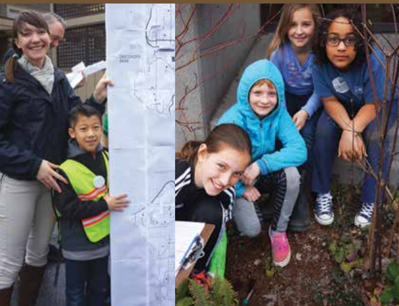
Top left: The 2014-15 Bertschi student Green Team. Top right: A student located their home on the carpool map. Bottom left: Green team members hosting Conscious Commuter week. Bottom right: Green team members testing soil temperature.

Bertschi is one of only four schools in Washington to have attained level 5 status with WA Green Schools, successfully tackling an issue of sustainability at each level.